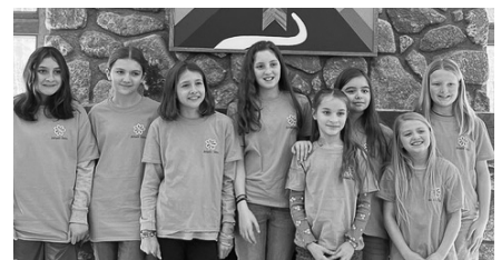
Abigail Girls at Camp Crossroads