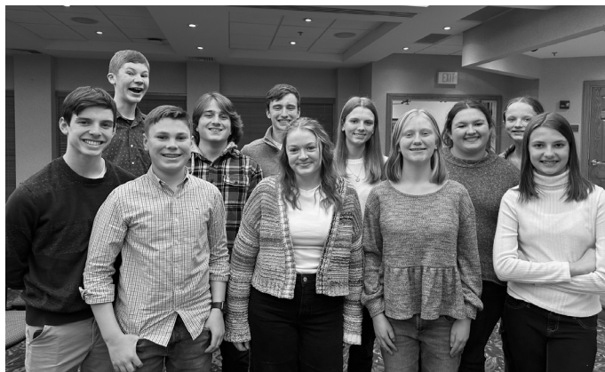
Student Choir singing at the Glebe