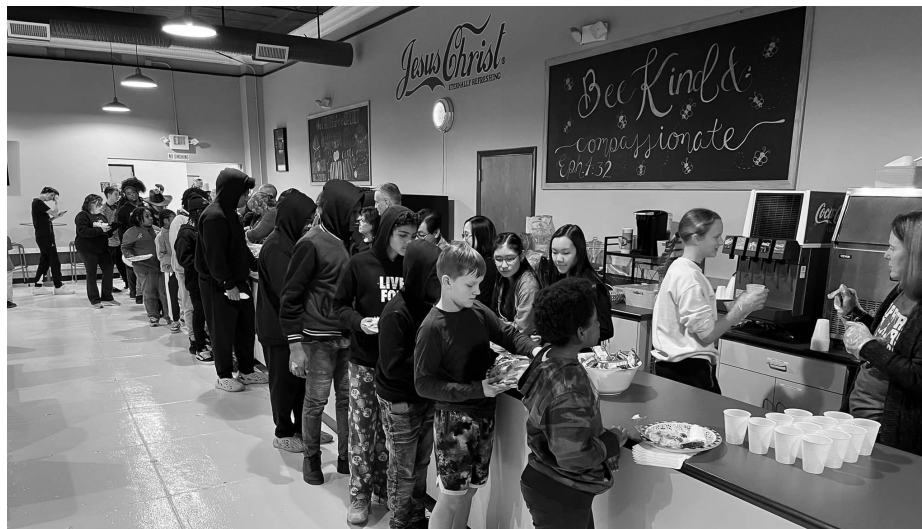
Sunday School class, 24/7 Living, serving a meal at Straight Street

Care Portal —connecting churches with families in need